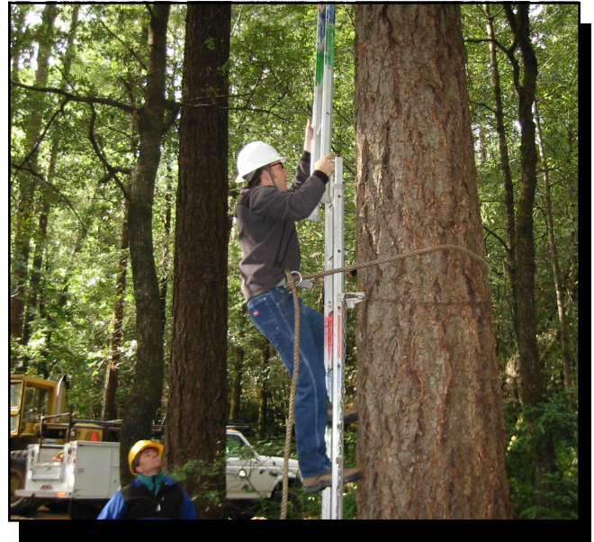
Figure 3—Increasing ladder heights by sections. The climber is secured to the tree by a climbing rope and the ladder is secured to the tree with a safety chain.

Rigging sets can be erected in a variety of ways, and the corresponding climbing methods may be selected by personal preference, impacts on the tree species, or the equipment that is available. The week of field training includes labs focused on three climbing methods: climbing with ropes, climbing with spurs or gaffs, and climbing with Swedish ladders (figure 3).