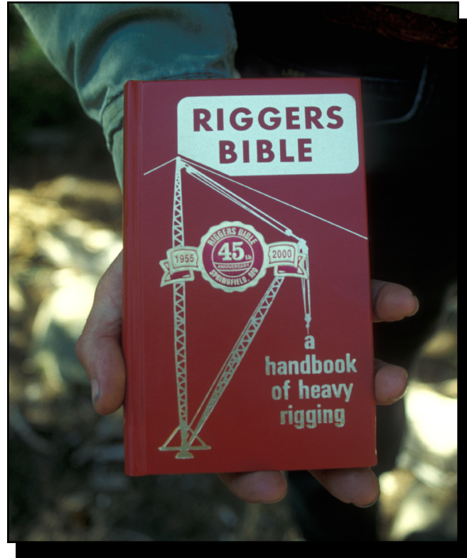
Figure 7— The Riggers Bible is an excellent source of technical information on the subject of rigging. Individuals must make themselves aware of current safety rules and regulations.

The Riggers Bible (figure 7) by Robert P. Leach is a good reference book on rigging. The book is sold by the Leach family for $35 and can be ordered by calling 417-869-9236. Copies may also be found by searching for used books on the Internet. While the Riggers Bible is an excellent source of technical information, individuals must make themselves aware of all current safety rules and regulations. Your regional safety officer may be able to help you find current rules and regulations.