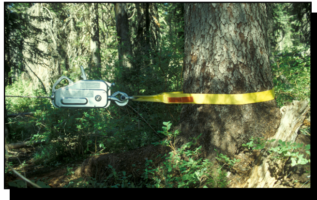
Figure 5—Grip hoists are used to tighten rigging cables.

Mechanical Advantage —Students are introduced to rigging through the use of direct pulls, change of direction, choker rolls, and mechanical advantage (figure 5). Load calculations for tension are completed before each practice set and tested with a dynamometer to make sure that the sets are within the equipment's safe working capacity.