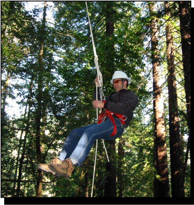
Figure 4—Climbing and descending trees by ropes is covered extensively in this class.