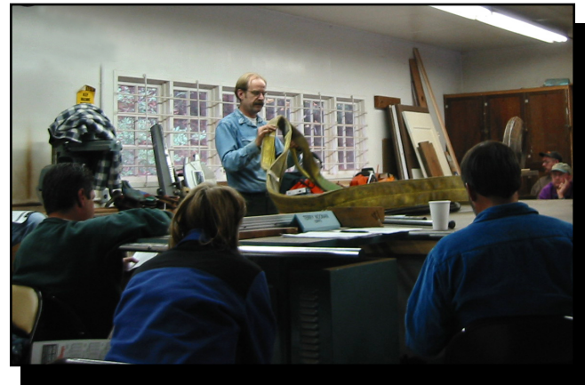
Figures 2a and 2b—Detailed instruction in rigging is given in both classroom and field settings.

During the past 30 years, the California Department of Parks and Recreation has improved its rigging and climbing procedures in cooperation with the U.S. Department of Labor, Occupational Safety and Health Administration, and timber industry personnel in logging systems and engineering. Changes were