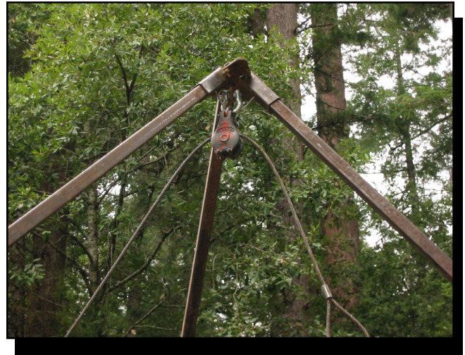
Figure 6—Portable tripods can be used in areas where trees are scarce.