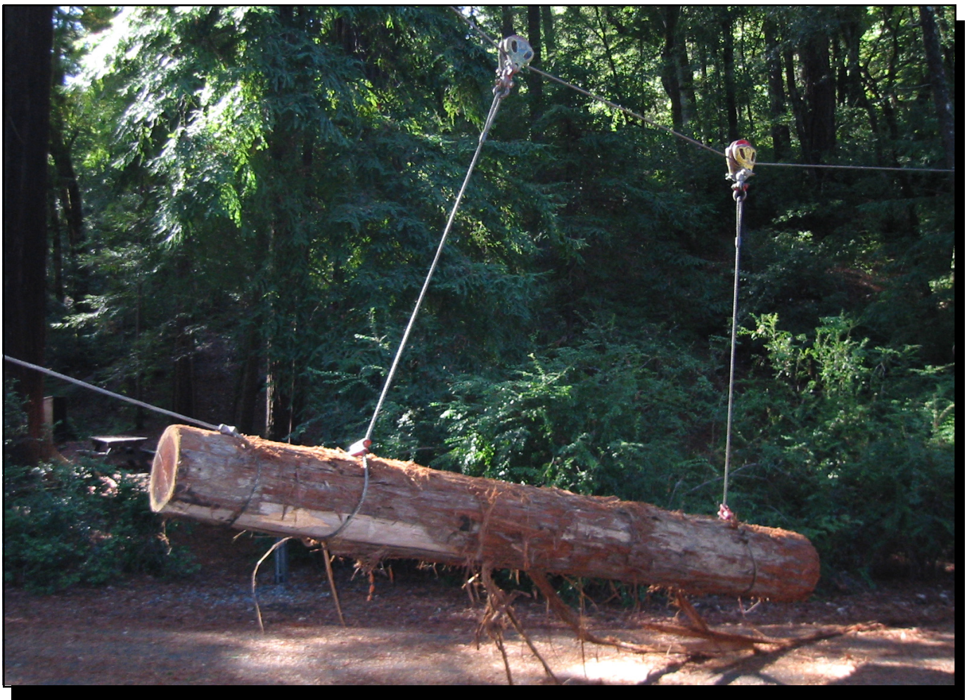
Figure 1—Moving a log suspended from an overhead cable.

trees to set blocks, lines, and other rigging equipment. Skylines set high above the ground help move heavy objects over long distances and across uneven slope and terrain. On any particular job, the qualified rigger and climber do not necessarily have to be the same